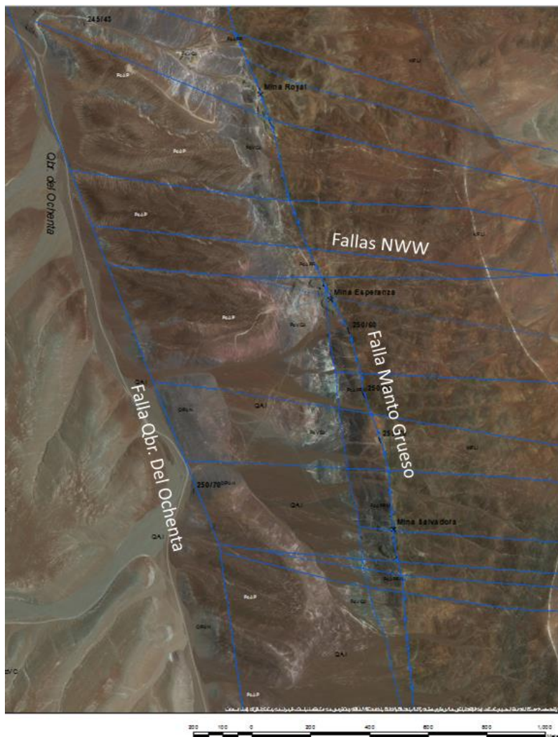
Figure 4. Rosario Project Structural Map