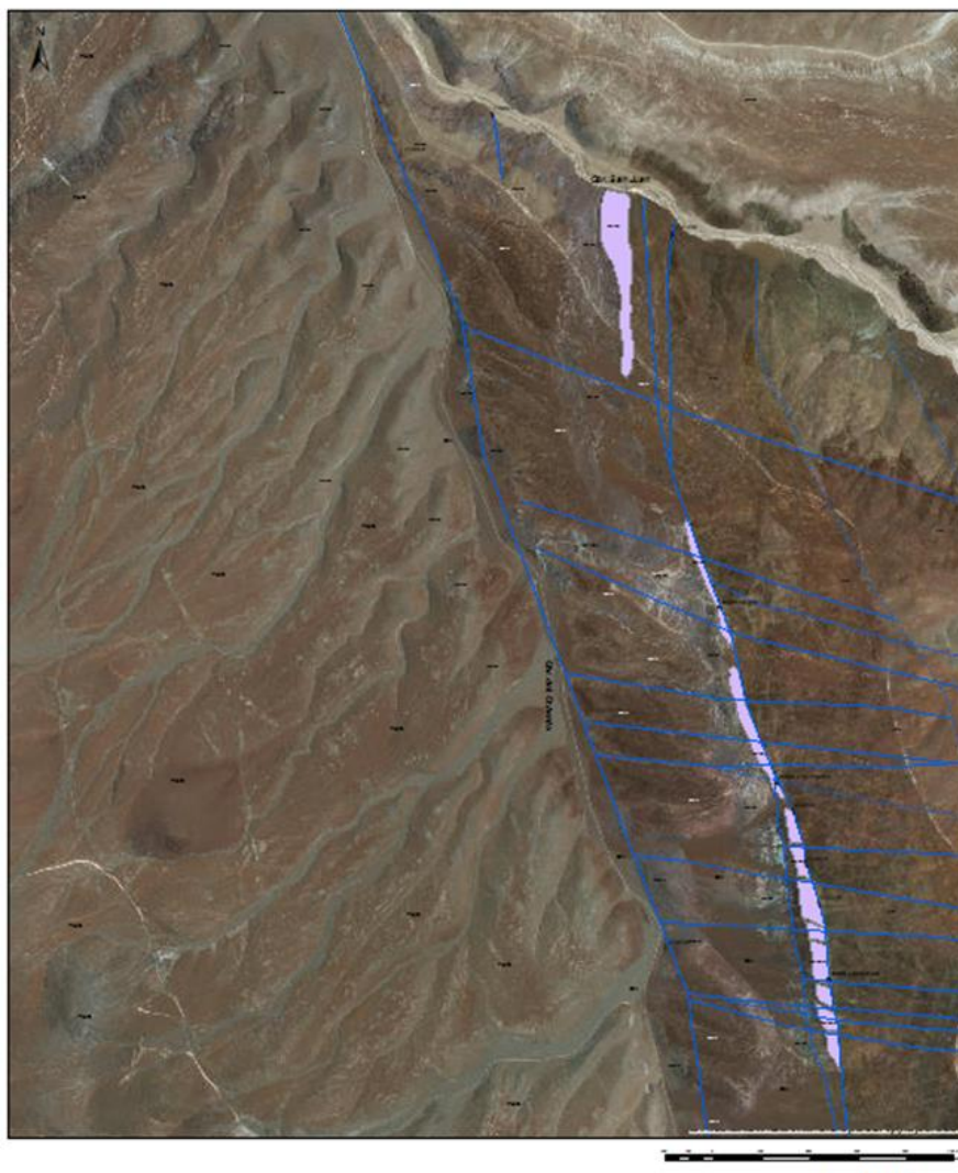
Figure 2. Rosario Project Mineralisation Map