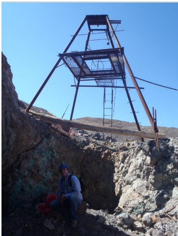
Figure 4. Salvadora

In July 2018, the Company confirmed the Chilean vendor had successfully upgraded the Rosario 6 and Rosario 7 licences from exploration to exploitation status having been granted 'Mensura'.