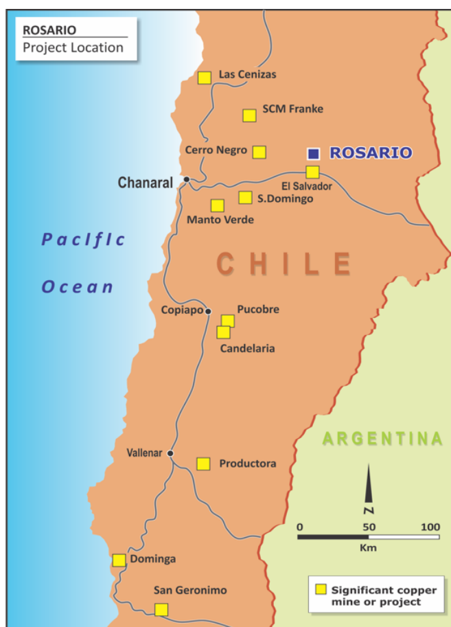
Figure 1. Location of the Rosario Project

It also lies less than 20 kilometres north of the El Salvador mine (owned by Codelco). It is one of the country's larger copper operations, within a region of dense mining activity (all scales) and good copper endowment.