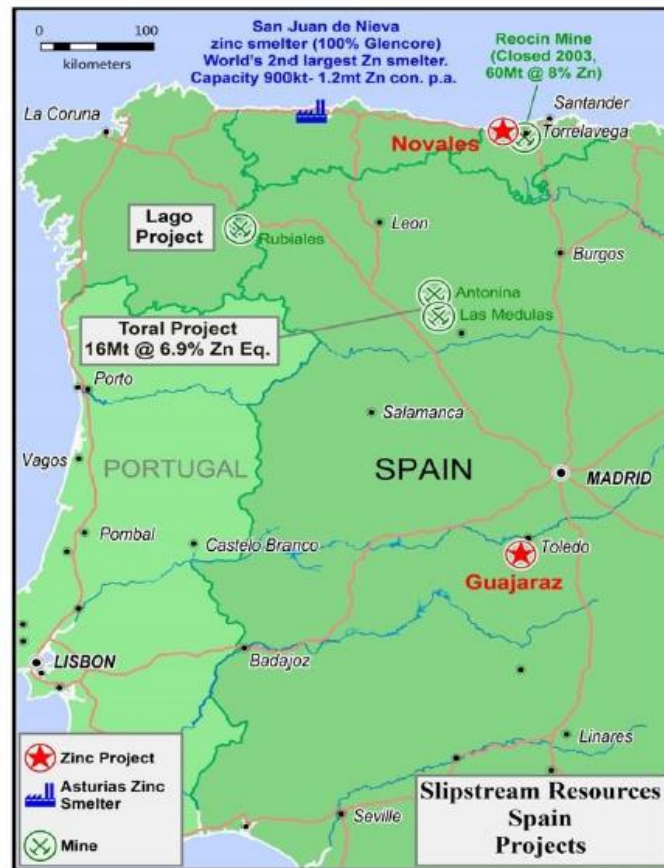
Figure 5. Location of the Novales-Udias and Guajaraz Projects

Initial Consideration for the Transaction is A$2.2 million payable through the issue of 1,100,000,000 new ordinary shares to the Vendors at a price of A$0.002 per ordinary share (the 'Issue Price'), subject to shareholder approval. The Company will also assume obligations to repay debt of A$0.6 million in cash. Additional milestone-based consideration, conditional on the delineation of JORC Mineral Resources (as summarised below) of A$2.2 million is to be satisfied through the issue of a further 1,100,000,000 new ordinary shares to the Vendors at the Issue Price subject to shareholder approval and ASX waiver. The vendors have agreed to a voluntary escrow of these shares.